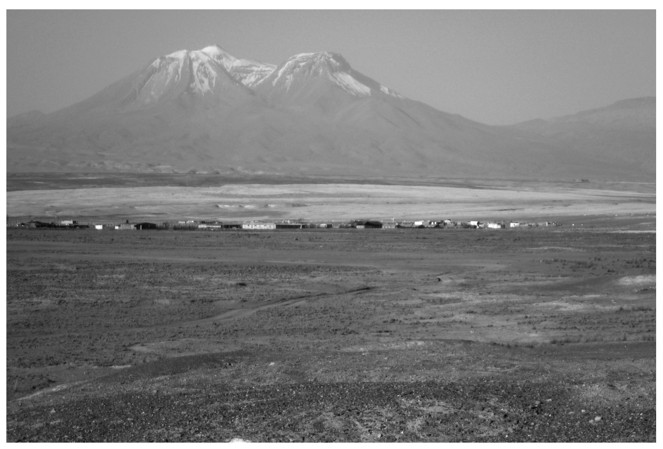
FIGURE 2 The vegas in 2012.

My dad fought hard to maintain his right to irrigate the wetland with his water. We had sheep and [other] animals. But no, it was impossible for him to keep the water. [The DGA] said that the wetland had its own water; but that was not true, they lied, lied, lied! They told us that the wetland was a kind of natural thing, so [my father] had no right to water. My dad insisted, but they said no, no, and no; and the wetland dried up. After that, only 2 drops ran through the wetland, and our animals died. ... My dad could not do anything. ... They only gave him water for his cultivated land.