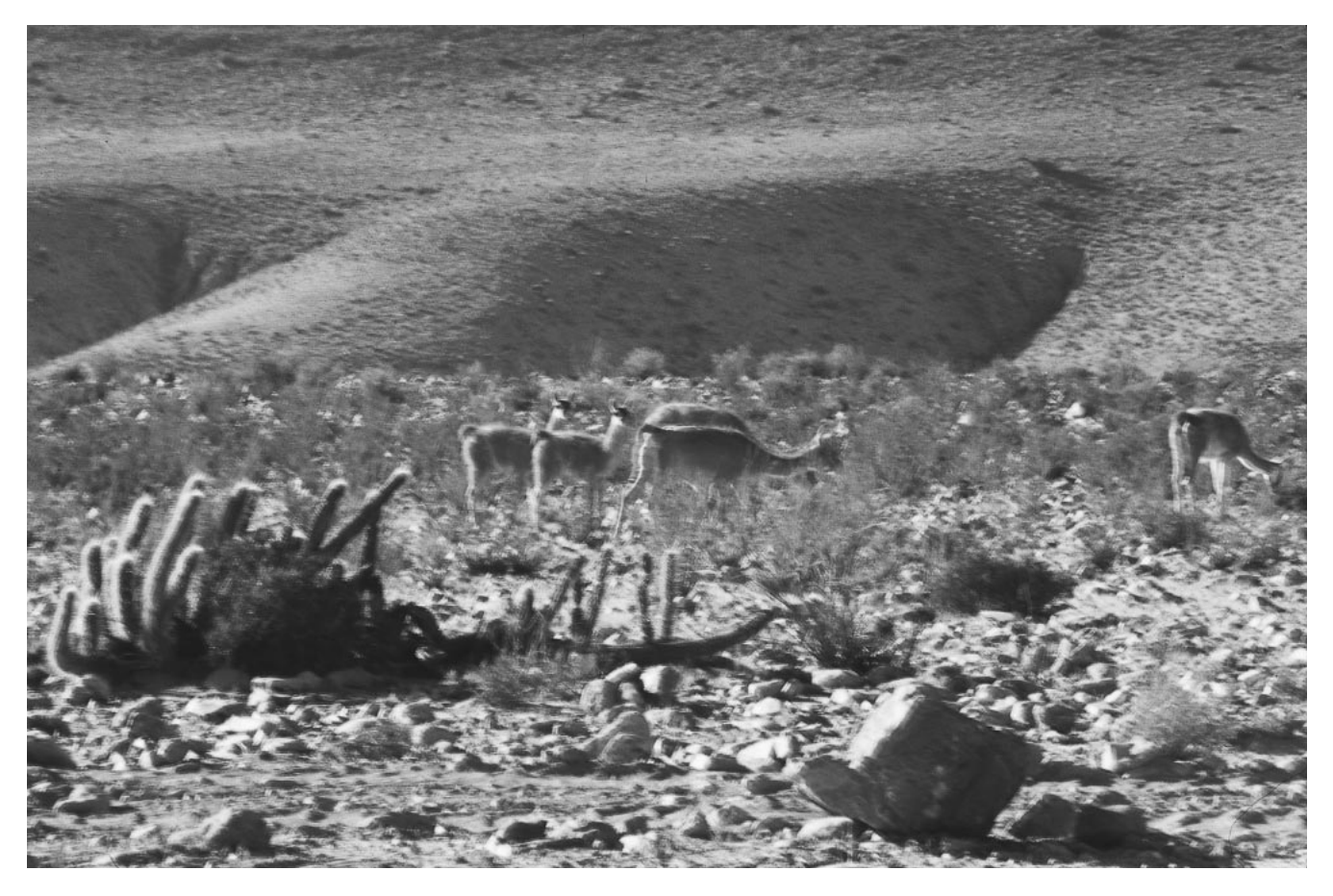
FIGURE 6 Grazing guanacos in pre-puna shrubland about 30 km southwest of Putre, outside of Lauca National Park. This habitat is poorly represented within the park.

leading to the creation of Las Vicuñas National Reserve adjacent to Lauca as an area where more active management can take place. Careful consideration is now being given to how herds of vicunas can be managed so that an industry can be developed by indigenous populations to harvest valuable vicuña fur in a sustainable manner and without violating the restrictions of CITES for this endangered species. Management and protection of Andean huemul, guanacos, and a variety of rare plant species in prepuna habitats can best be implemented by adding larger areas of these habitats to the existing park (Figure 6). This issue is discussed in more detail below.