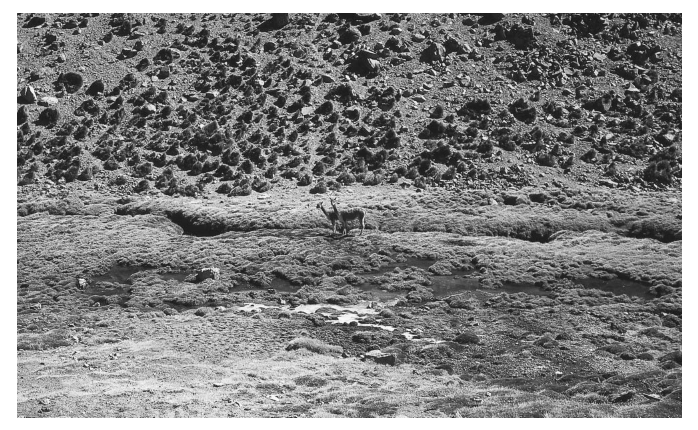
FIGURE 4 Grazing vicuñas on one of the roadside bofedales near Las Cuevas in Lauca National Park. The rocky hillside slopes behind are dominated by perennial bunchgrasses, particularly Festuca orthophylla and Deyeuxia breviaristata .