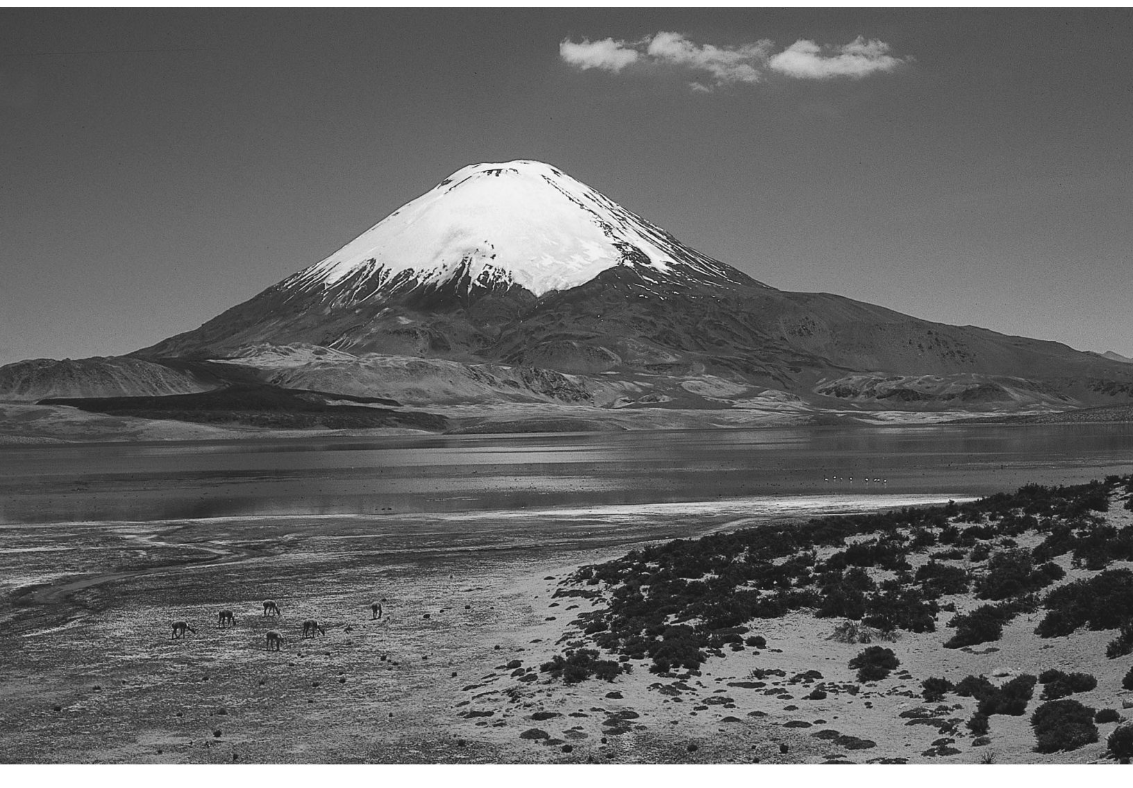
FIGURE 2 Volcán Parinacota (6342 m) with Lago Chungará, the highest elevation lake in the world, at its base. In the right foreground are dwarf woodlands dominated by Polylepis tarapacana , and the left foreground shows wetland habitats termed bofedales with grazing vicuñas.

The relatively gentle topography within the Lauca Basin averages about 4100 m in altitude, giving it an elevation about 500 m higher than Lago Titicaca. Geological evidence and climate indicators such as pollen, evaporites, and sedimentary facies indicate that an arid climate has existed in the Lauca Basin over the past 6.2 million years (Kött et al 1995; Gaupp et al 1999).