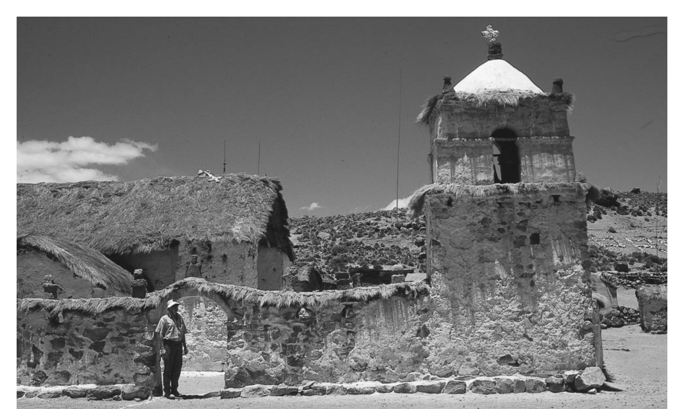
FIGURE 5 Village of Parinacota at 4400 m elevation in Lauca National Park. The church was originally constructed by the Spanish conquistadors in the 17th century, and rebuilt in 1789.

Human history in the Lauca region of Parinacota Province extends back thousands of years. Hunter-gatherers are thought to have inhabited this region at least 7000 years ago and perhaps as far back as 10,000 BP. Agricultural and herding centers began to develop