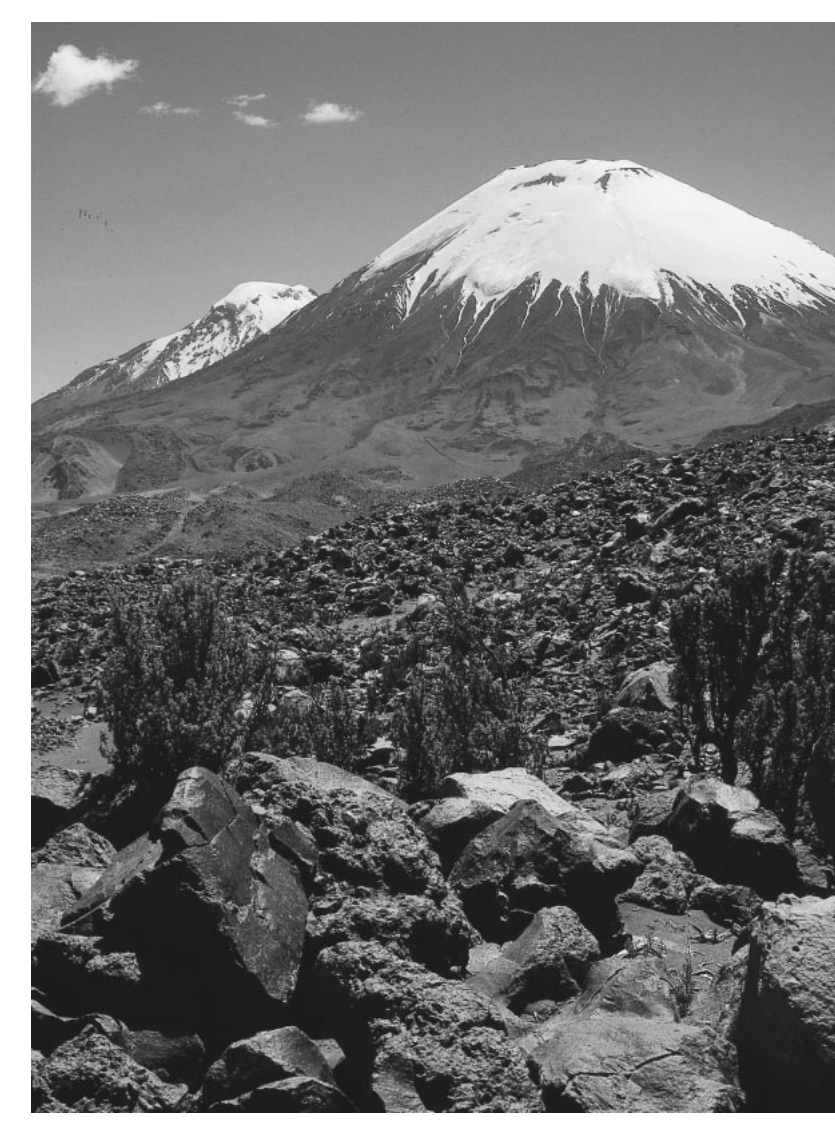
FIGURE 3 Volcán Ponerape (6240 m, left) and Volcán Parinacota (6342 m, right) tower over rocky lava ridges with stands of Polylepis tarapacana growing with Parastrephia lucida and Azorella compacta .

The biogeographic affinities represented in the flora of Lauca National Park and adjacent areas of Parinacota Province show differing patterns between zonal and wetland floras. The flora of zonal habitats of the prepuna and puna show stronger floristic links to a regional puna flora extending from southern Peru and western Bolivia into northern Chile and Argentina. This puna flora in the Andean puna habitats of northern Chile is markedly distinct from that of the Andean flora characteristic of the central and southcentral Andes, where winter rainfall regimes exist (Arroyo et al 1988). There is a stronger floristic similarity, however, between the puna wetland flora of northern Chile and the Andean wetland flora of central and southern Chile, and little local endemism is present in this group (Arroyo et al 1982, 1988; Ruthsatz 1993).