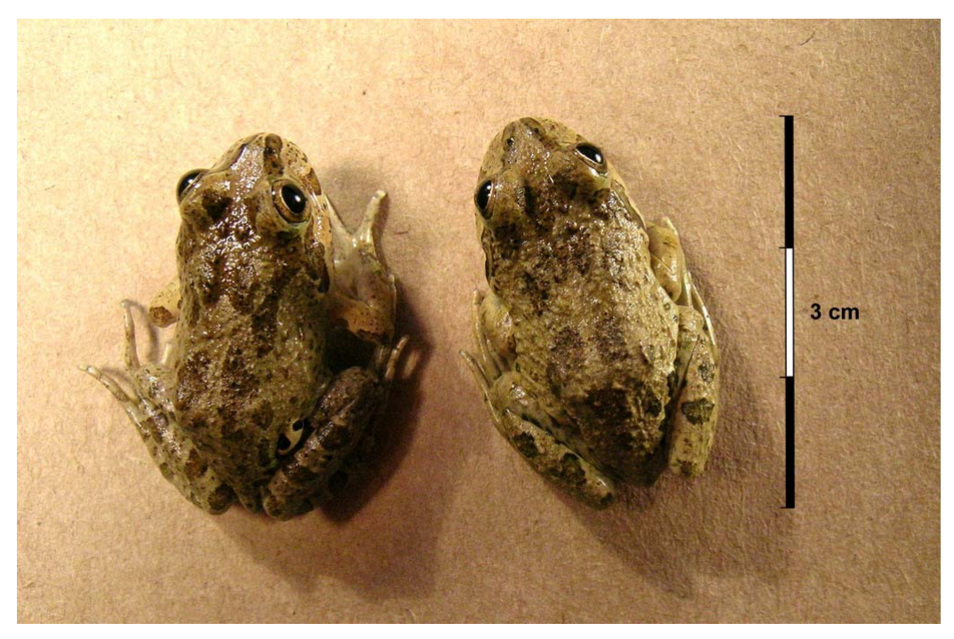
Figure 2. Subadult specimens of Pleurodema thaul from the locality of Carrera Pinto.