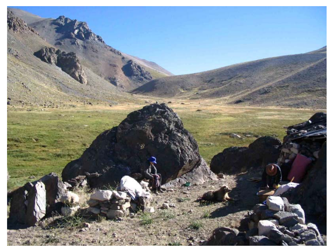
Figure 4. Panoramic view of the locality of Vega Piuquenes.