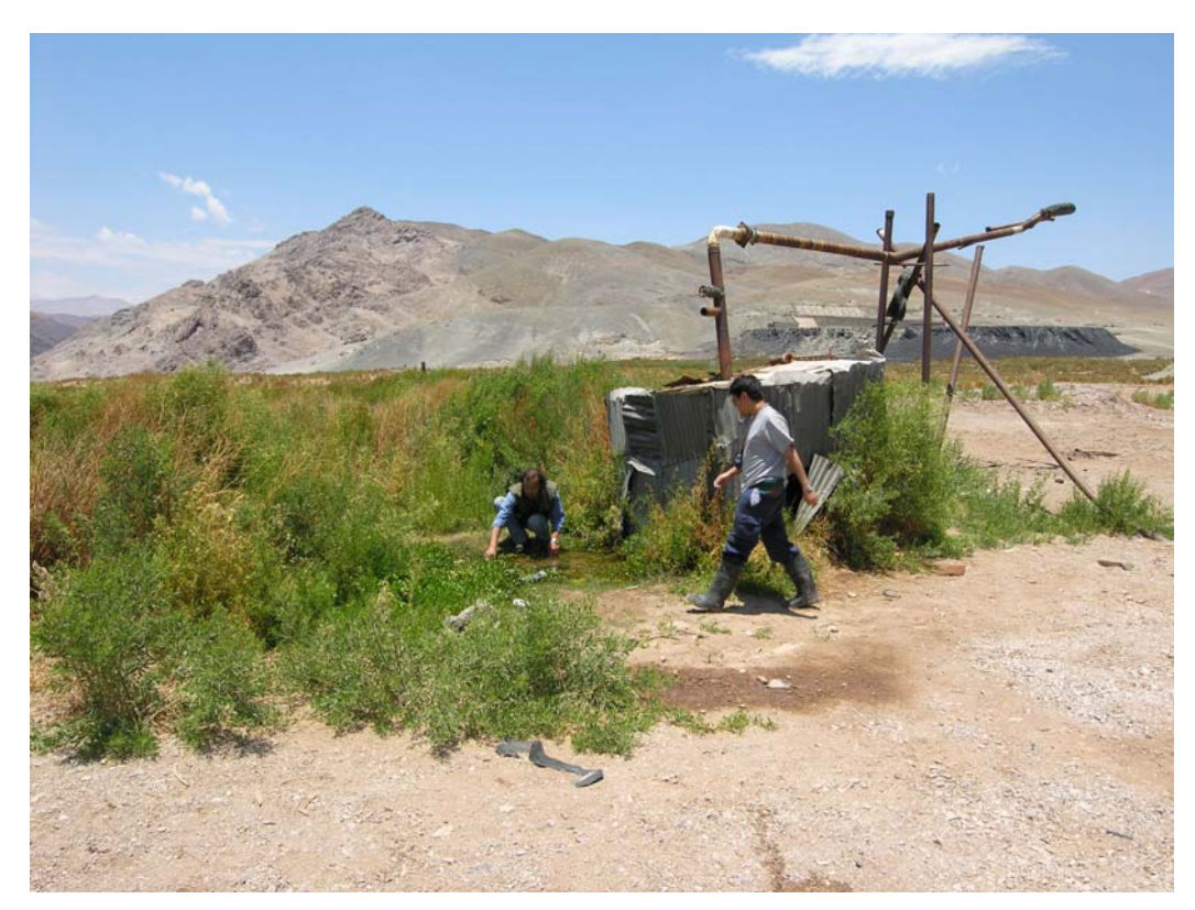
Figure 3 . Sampling site in Carrera Pinto oasis, showing the exact place where water springs up. Two authors, C. L. Correa (walking) and E. R. Soto, appears in this photography.