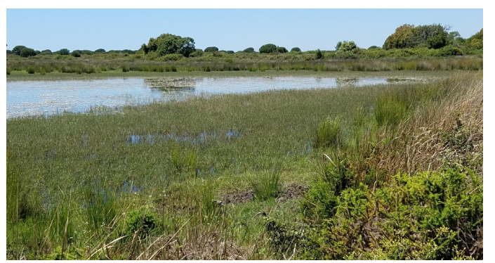
PHOTO #8 : Doñana National Park, Ramsar Wetland of International Importance.