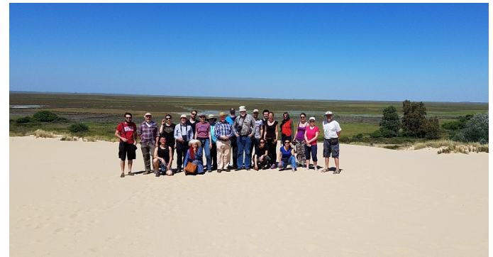
PHOTO #10 : SWS Europe Chapter members on field trip to the Donãna National Park.