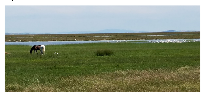
PHOTO #9 : Wild horses graze near egrets, with flamingos in the distance, at Donãna National Park.