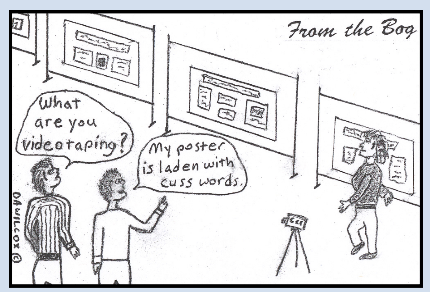
An observational experiment.